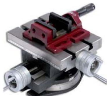
Standard, Swivel Base with Drill Press Vice