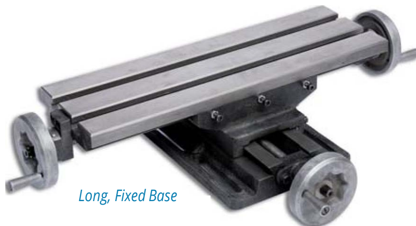
Long, Fixed Base