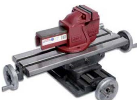
Long, Fixed Base with Engineers' Vice