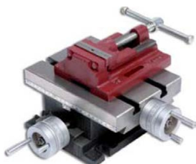
Standard, Fixed Base with Machine Vice